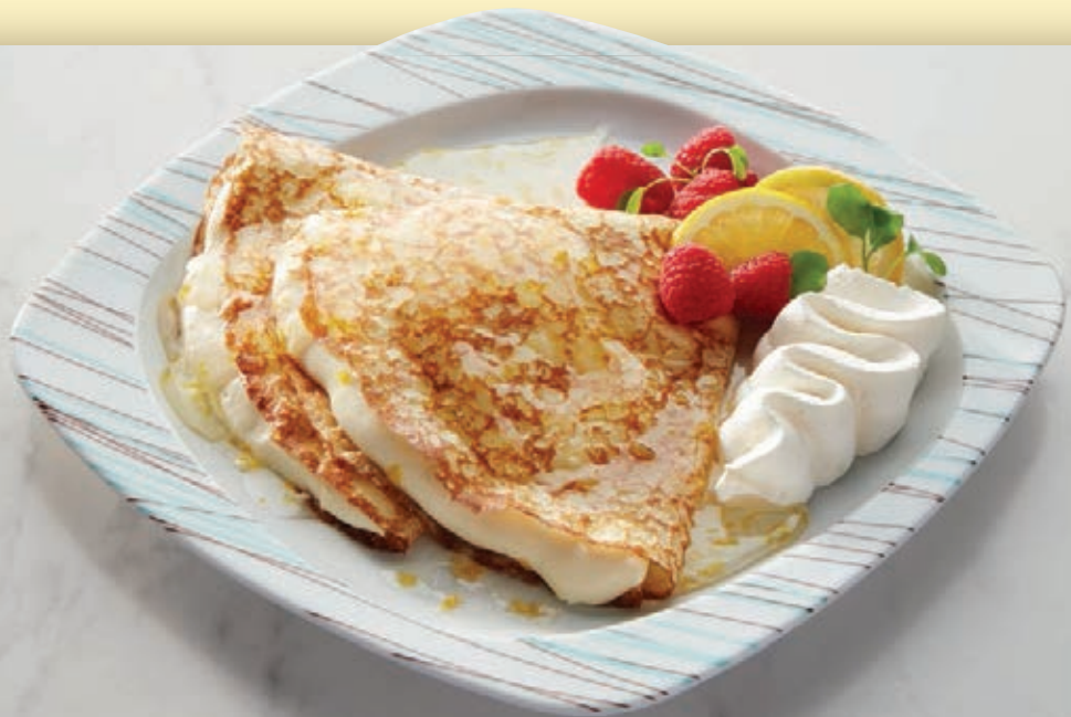
LEMON CHEESECAKE: Vanilla Reduction

Items may be served raw or undercooked, or contain (or may contain) raw or undercooked ingredients. Consuming raw or undercooked meats, seafood, shellfish, eggs, milk or poultry may increase your risk of foodborne illness, especially if you have certain medical conditions.