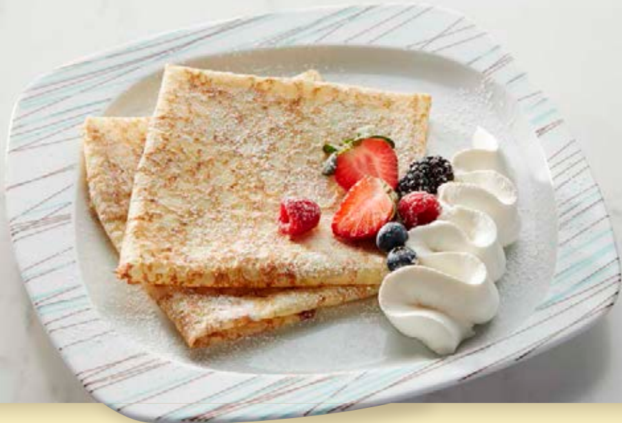
PLAIN OR CHOCOLATE CREPE