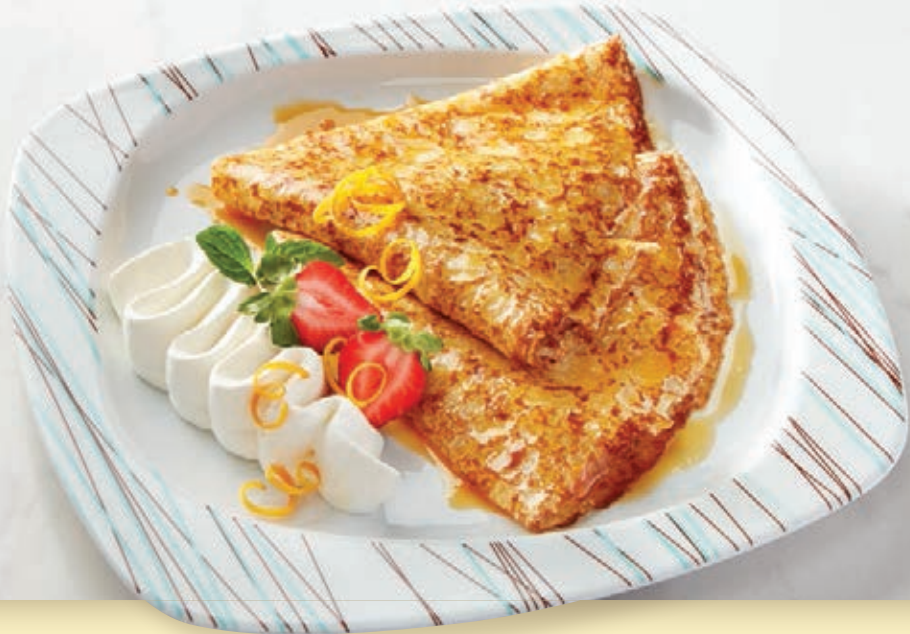
CREPES SUZETTE: Grand Marnier Sauce, Whipped Cream