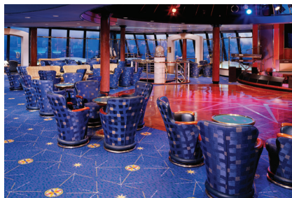
Galaxy of the Stars

This top-of-the-ship lounge offers fantastic views, nightly live music, dancing and cocktails. Seating capacity 408 (9,042 sq. ft.) (840 m 2 )