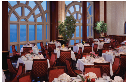
Windows Main Dining Room

This dining room offers five-course feasts, an amazing wine menu and to-die-for desserts. Seating capacity 606 (7,700 sq. ft.) (715 m 2 )