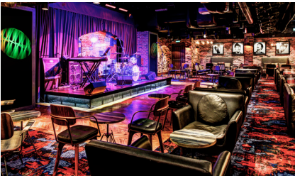
The Cavern Club

The Cavern Club Step inside a recreation of the legendary Liverpool club where the Beatles performed. Listen to the tunes of a Beatles cover band and other live musical acts. Seating capacity 93 (2,313 sq. ft.) (215 m2)