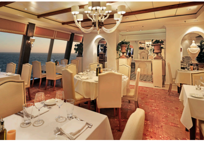
La Cucina Italian Restaurant

La Cucina Italian Restaurant Traditional Italian meals are served with a modern twist. Seating capacity 182 (3,831 sq. ft.) (356 m²)