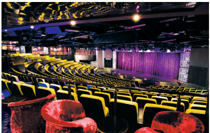
The Epic Theater

The Epic Theater It takes a world-class venue to attract a world-famous shows like Priscilla, Queen of the Desert — The Musical. Seating capacity 680 (8,474 sq. ft.) (787 m2)