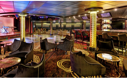
Bliss Ultra Lounge

Bliss Ultra Lounge Three mood-lit bowling alleys, nonstop music, plasma screens and plenty of partying. Seating capacity 310 (7,801 sq. ft.) (725 m2)