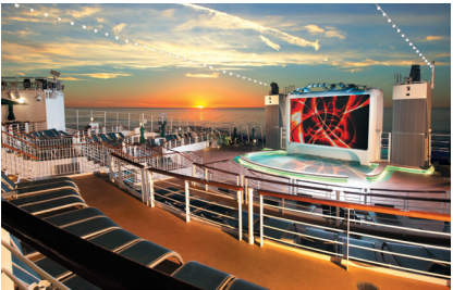
Spice H 2 O

Spice H 2 O An adults-only sultry, Ibiza-inspired beach club at the back of the ship. Seating capacity 170 (9,759 sq. ft.) (907 m²)