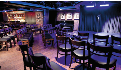
Headliners Comedy Club

Headliners Comedy Club Your sides will definitely ache after a night at Headliners Comedy Club thanks to the comedic stylings of Levy Entertainment Group, exclusively at sea on Norwegian Getaway. Employing over 300 artists nationwide, Levy is the largest producer of live comedy, creating tours and TV specials for the biggest names in the industry, including Daniel Tosh, Amy Shumer, Gabriel Iglesias, Jeff Dunham and more. Enjoy the hysterical musings of Levy’s best and brightest with 12 hilarious shows per week. Hope your funny bone isn’t that ticklish. Seating capacity 271.