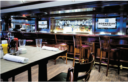
O'Sheehan's Neighborhood Bar & Grill

O'Sheehan's Neighborhood Bar & Grill This place is so inviting everyone here really may eventually know your name. Dine on American classics like chicken wings and meatloaf, as well as your favorite comfort foods, including fish and chips, burgers and more, all served 24 hours a day. Seating capacity 269 (5,305 sq. ft.) (493 m²)