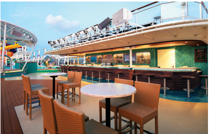
Waves Pool Bar

Waves Pool Bar Relax in a lounge chair, frozen drink in hand, and not a worry in the world. Seating capacity 129