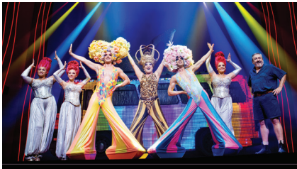
Priscilla, Queen of the Desert — The Musical

Priscilla, Queen of the Desert — The Musical Hop on a battered bus for the most fabulous road trip at sea. Based on the Oscar-winning movie, Priscilla, Queen of the Desert — The Musical is the heart-warming, uplifting comedy adventure of three friends searching for love and friendship and features a string of dance-floor favorites, including “It’s Raining Men,” “I Will Survive” and “Girls Just Wanna Have Fun.”