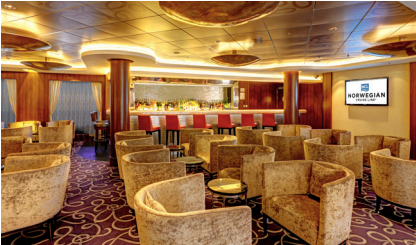
Shaker's Martini Bar

Shaker's Martini Bar Shaken or stirred, happy hour always lives up to its name. Seating capacity 70 (1,969 sq. ft.) (183 m2)