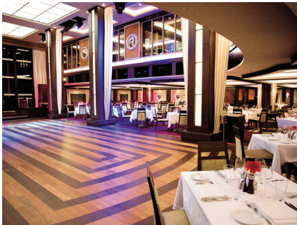
The Manhattan Room

The Manhattan Room You'll feel like you're in a private New York City supper club, thanks to panoramic ocean views from the two-story, floor-to-ceiling windows. And it's the perfect venue to see the special cabaret performances from Legends in Concert and their world's greatest impersonators. Seating capacity 594 (12,912 sq. ft.) (1,200 m²)