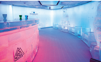
SVEDKA & Inniskillin Ice Bar

SVEDKA & Inniskillin Ice Bar Inspired by the ice hotels of Scandinavia, the industry's first true ice bar is as cool as it gets. Slip into one of our faux fur coats to keep you warm in the chilly 17°F. Of course, the vodka helps, too. Seating capacity 10 (355 sq. ft.) (33 m²)