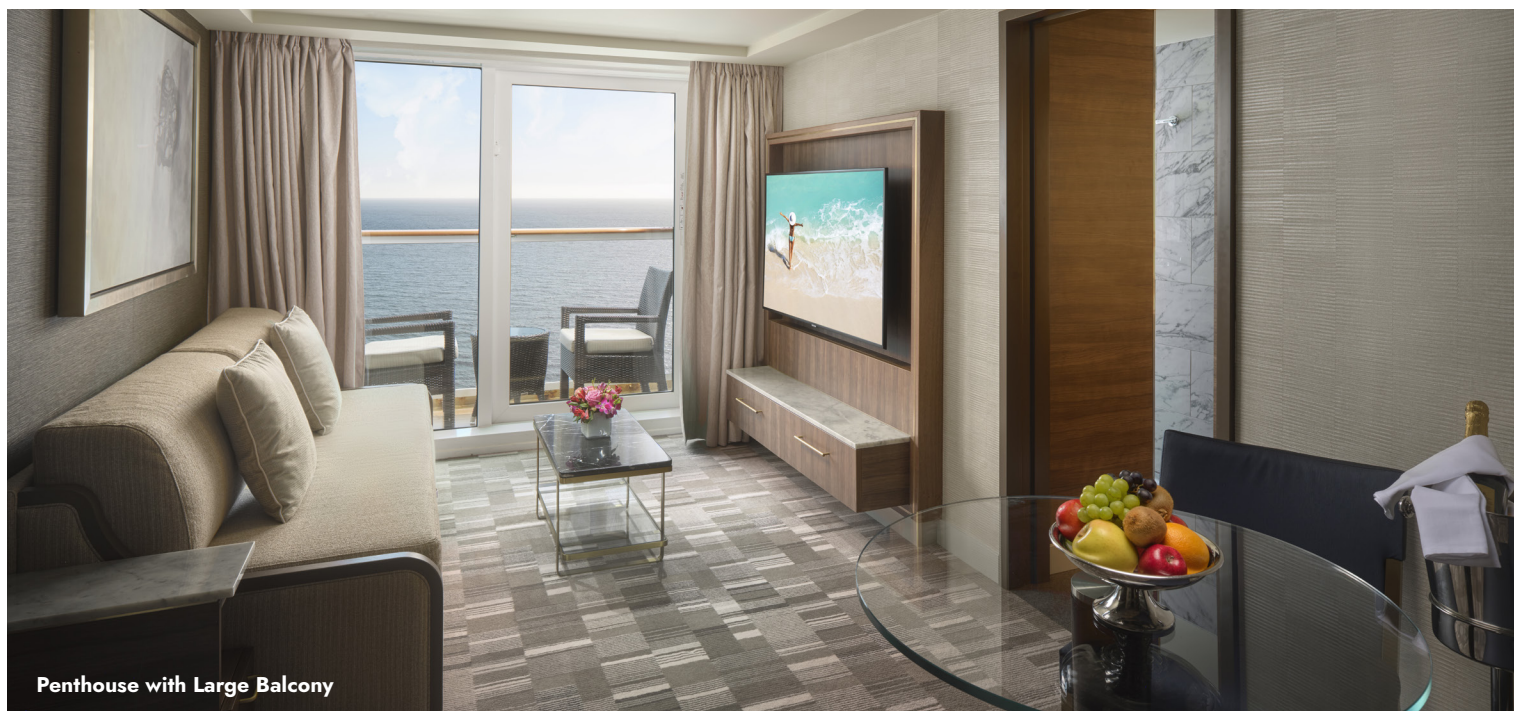
Penthouse with Large Balcony