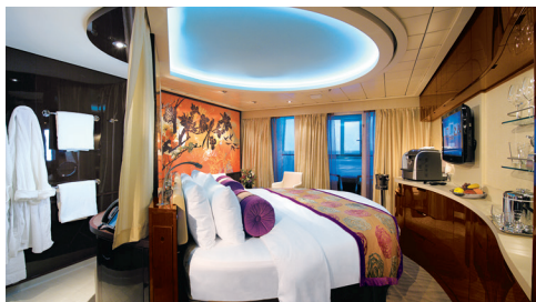
The Haven Courtyard Penthouse with Balcony