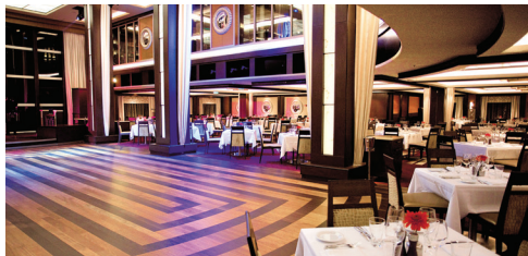
The Manhattan Room