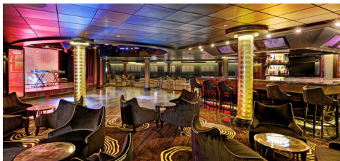
Bliss Ultra Lounge

Seating capacity: 226; Reception capacity: 271