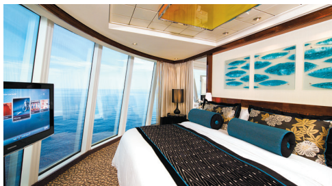
The Haven Deluxe Owner's Suite with Large Balcony