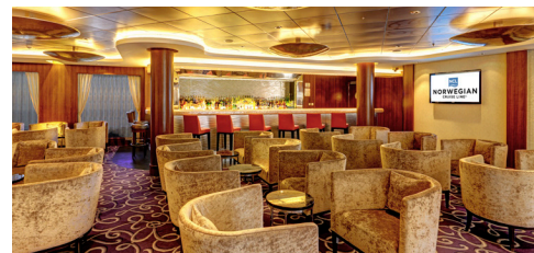
Shaker's Martini Bar

Seating capacity: 66; Reception capacity: 84