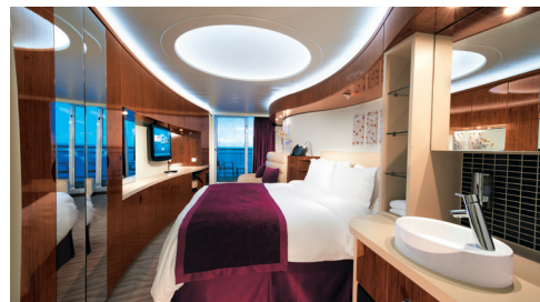
Club Balcony Suite