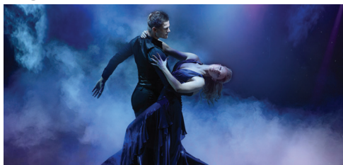
Burn the Floor®

Swiveling hips. Steamy embraces. High-octane tempos. Burn the Floor's performances aren't just hot, they sizzle. This renowned Broadway show brings ballroom and Latin dance theater to sea.