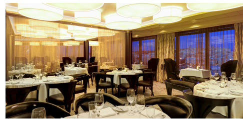
The Haven Restaurant