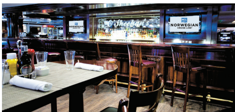
O'Sheehan's Neighborhood Bar & Grill

Try a few of the many beers on tap and catch a game on the two-story TV screen or play some billiards or darts. Seating capacity: 212