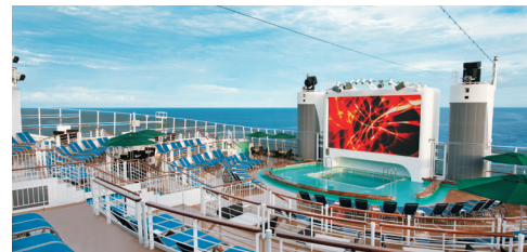
Spice H 2 O