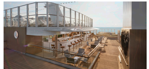
Vibe Beach Club

Deck 20: Seating capacity 115; Reception capacity: 138