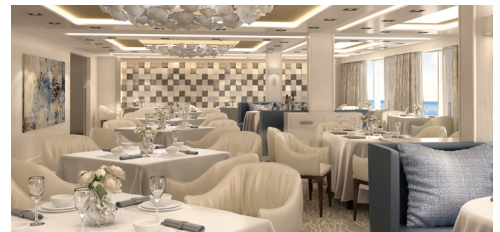
The Haven Restaurant