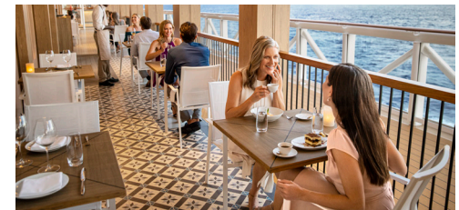
Onda by Scarpetta, The Waterfront

Seating capacity: 108 Indoor; 44 Waterfront