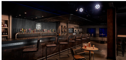
The District Brew House

Seating capacity: 104; Reception capacity: 107