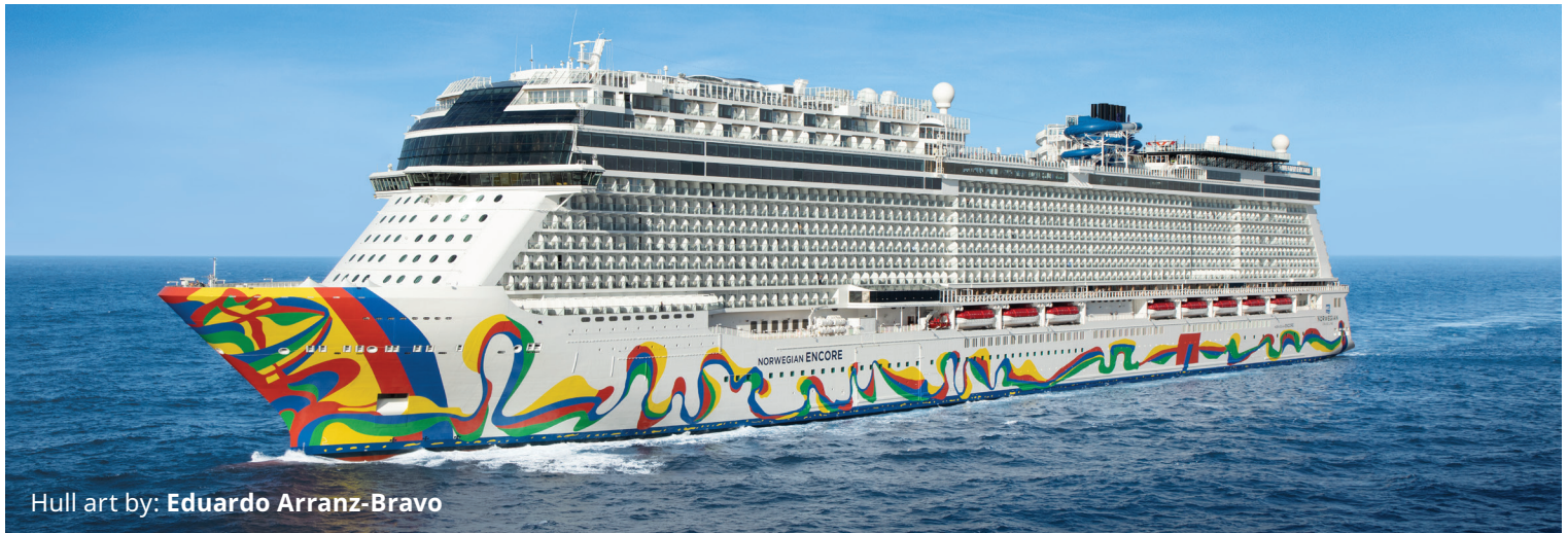
Hull art by: Eduardo Arranz-Bravo

Built: 2019 • Gross Tonnage: 169,116 • Guests (Double Occupancy): 3,998 • Overall Length: 1,094 feet • Max Beam: 136 feet • Crew: 1,735