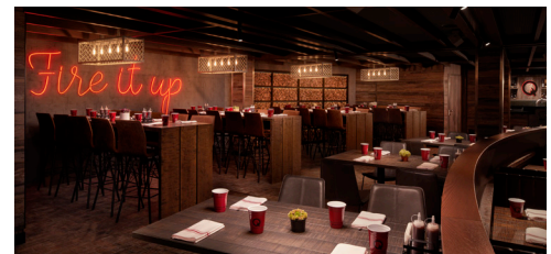
Q Texas Smokehouse