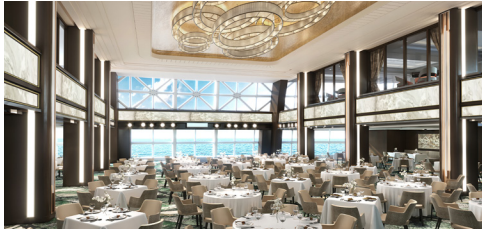
The Manhattan Room