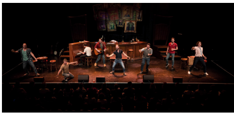
The Choir of Man

Raise your glass to high-energy dancing and hit songs that flow as freely as the beer. You'll feel right at home in The Jungle, the rockin' English pub where the talented cast performs everything from classic rock hits and pub tunes to sing-along favorites.