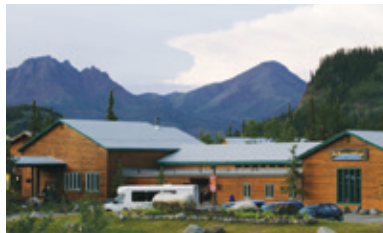
DENALI PARK VILLAGE

MP 240 GEORGE PARKS HWY DENALI NATIONAL PARK DENALI, AK 99755 907.683.5100