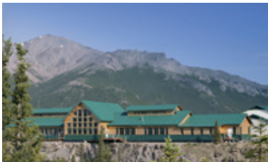
GRANDE DENALI LODGE

MP 240 GEORGE PARKS HWY DENALI NATIONAL PARK DENALI, AK 99755 907.683.5100