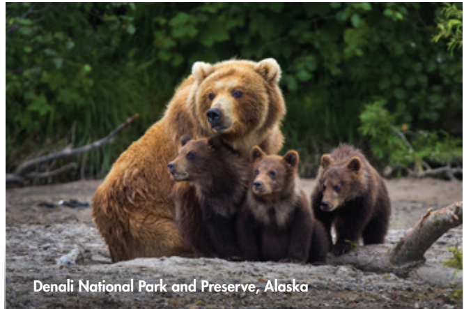
Denali National Park and Preserve, Alaska

Each trip is approximately three hours with a total of two hours on the water. The Canyon Run is an exciting whitewater (Class III/IV) adventure. This is one ride where you will get wet! The Scenic Float is great for families. Enjoy scenic beauty along with Class II/III rapids.