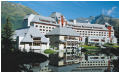
HOTEL ALYESKA RESORT

1000 ARLBERG AVE GIRDWOOD, AK 99587 907.754.2108