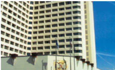
SHERATON ANCHORAGE HOTEL & SPA

401 E 6TH AVE ANCHORAGE, AK 99501 907.276.8700