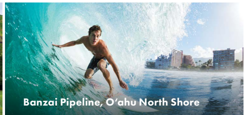
Banzai Pipeline, O'ahu North Shore