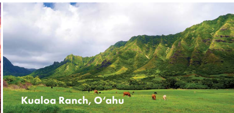
Kualoa Ranch, O'ahu