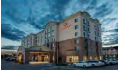
CROWNE PLAZA 109 W. INTERNATIONAL AIRPORT ROAD ANCHORAGE, AK 99518