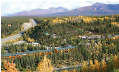
DENALI GRIZZLY BEAR RESORT DENALI NATIONAL PARK DENALI, AK 99755 907.683.2696