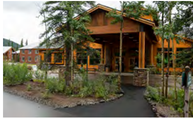
DENALI PARK VILLAGE 231 GEORGE PARKS HIGHWAY DENALI NATIONAL PARK, DENALI, AK 99755 800-276-7234