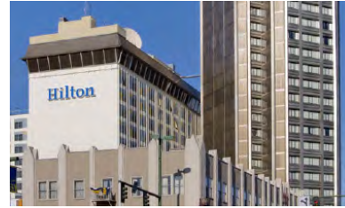
HILTON ANCHORAGE HOTEL 500 W 3RD AVE, ANCHORAGE, AK 99501