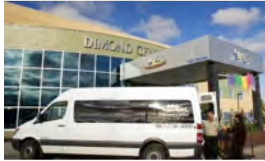
DIMOND CENTER HOTEL 700 EAST DIMOND BOULEVARD ANCHORAGE, AK 99515