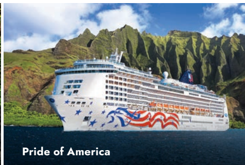
Pride of America