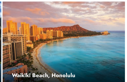
Waikiki Beach, Honolulu