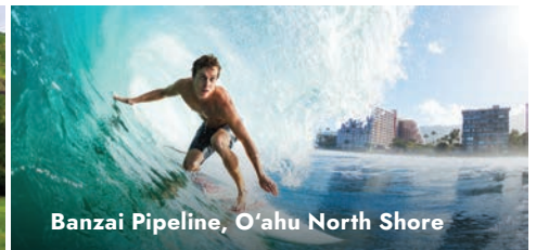
Banzai Pipeline, O'ahu North Shore