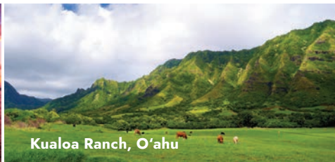
Kualoa Ranch, O'ahu