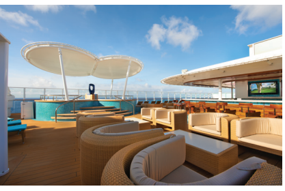
Vibe Beach Club

Adults-only beach club featuring a full bar. Limited number of passes available for purchase. Seating capacity 85 (5,380 sq. ft.) (500 m<sup>2</sup>)