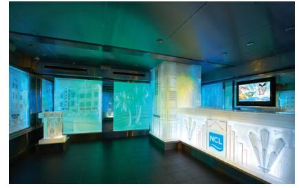
Svedka & Inniskillin Ice Bar

Inspired by the original ice hotels in Scandinavia, chill out in a 17° arctic chamber where the bar, walls, seats and glasses are all made from ice. Hooded coats and gloves are provided. Seating capacity 25 (516 sq. ft.) (48 m<sup>2</sup>)