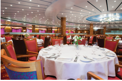
Four Seasons Main Dining Room

You'll love this dining room's five-course feasts, amazing wine menu and to-die-for desserts. Seating capacity 494 (11,000 sq. ft.) (1,022 m 2 )