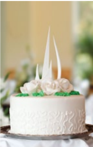
SHIMMERING ROYALTY $7 (up to 25 guests)

Vanilla, Chocolate, Mocha, Coffee, Caramel, Pistachio, Strawberry, Raspberry, Blueberry, Orange, Lemon, Pineapple.