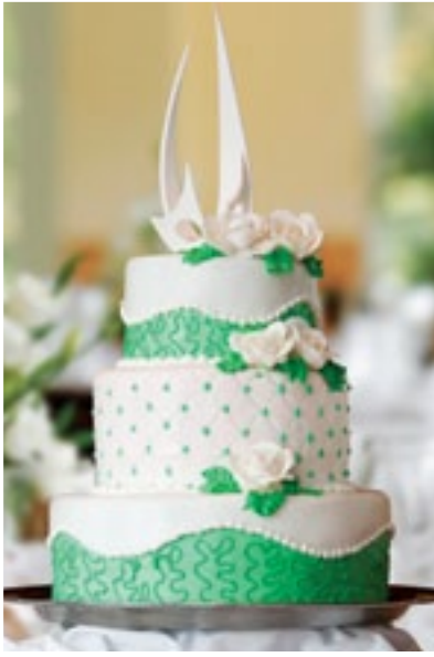
BRIDAL BLISS $9.75 (51-100 guests)