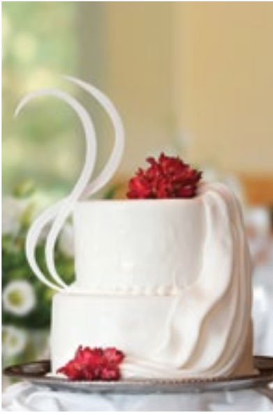
ENCHANTING PEARL $9 (26-50 guests)