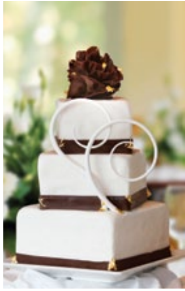
SIMPLE & SWEET $10 (101-150 guests)