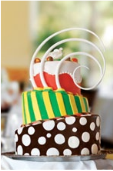
TROPICAL ELEGANCE $9.75 (51-100 guests)